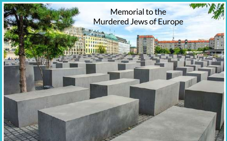
Memorial to the Murdered Jews of Europe