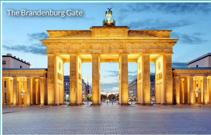
The Brandenburg Gate