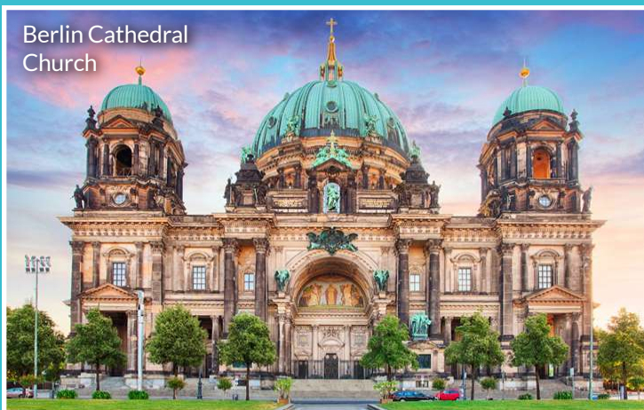
Berlin Cathedral Church