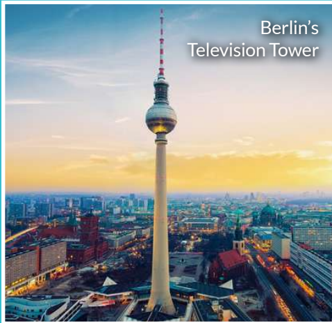
Berlin's Television Tower