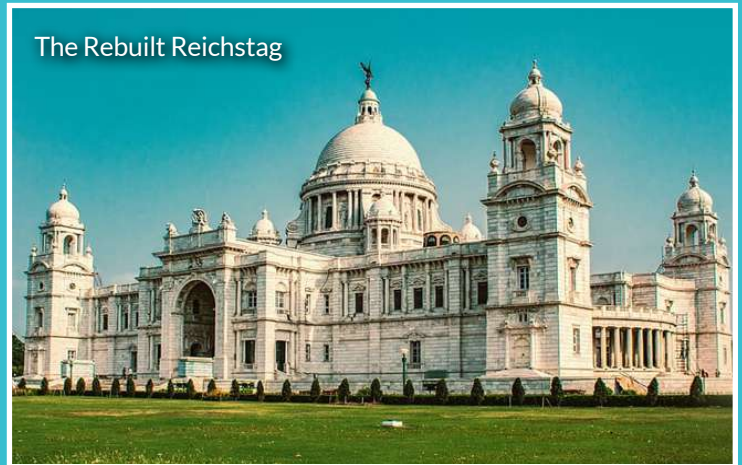
The Rebuilt Reichstag