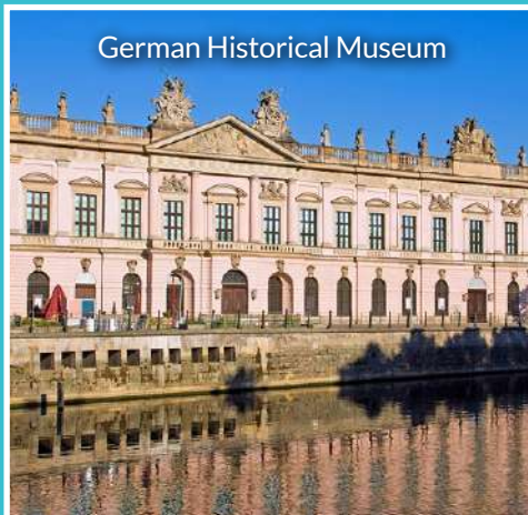
German Historical Museum